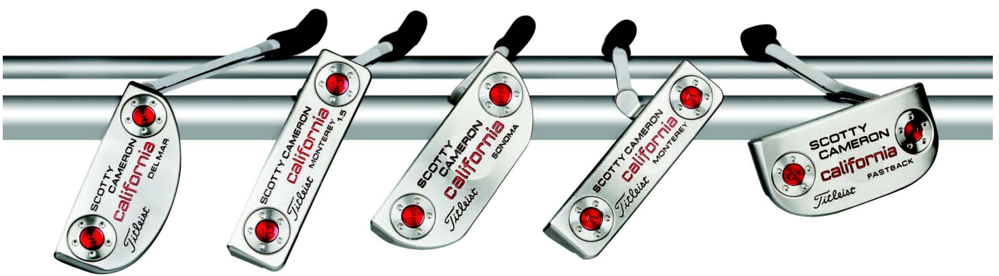
Maximum Toe Flow

Toe flow or face balance is very important when selecting the proper putter design.